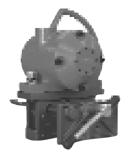
SVRFS-4000 & CCF-2000 Turbine Air & CCF-1 Bracket. (See page 12-14 for technical data.)