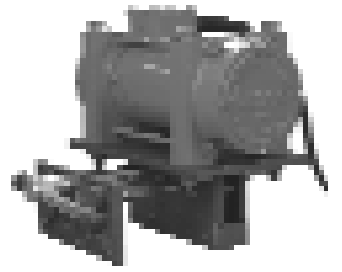
2P-200 Electric & VMF-2 Bracket. (See page 16 for technical data.)