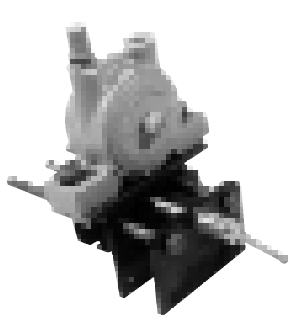
BVS or VS-510 Pneumatic on BVF-21 bracket. (See page 12-14 for technical data.)